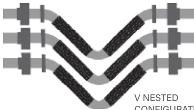
V NESTED CONFIGURATION

The design of the V allows for easy configuration. The V can be nested within additional V's, taking up less valuable space and does not require additional pipe extensions. Nesting V configurations do not require any special order components. Ordering in stock connectors saves you both time and money.