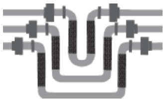
U NESTED CONFIGURATION

The U connector has a larger nesting footprint than that of the V connector. Nested U connector can be used in parallel pipe runs to keep all the expansion devices at one location and to save space. They can also be nested in any number of sequences and with any number of pipes. Just specify pipe diameter sequence and the corresponding distance between pipe center lines when ordering.