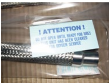
Assembly that has been cleaned and bagged for oxygen service.

Oxygen cleaning services are performed in-house in our clean room.