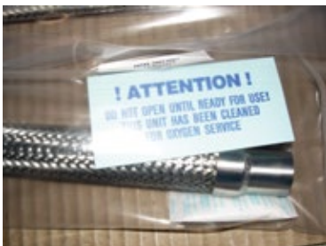
Assembly that has been cleaned and bagged for oxygen service.

Oxygen cleaning services are performed in-house in our clean room.