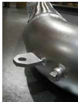
ELBOW WITH DRAIN AND HANGER